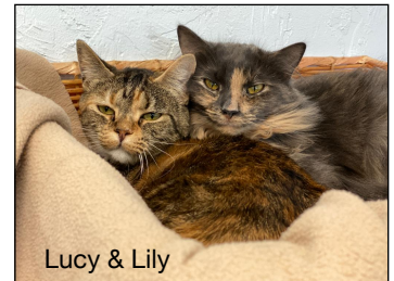
Lucy & Lily

Junebug and Sophia came to us upon the reopening of the shelter. They came from the same cat colony and are most likely related (mother/daughter perhaps). They were pretty scared at first, but volunteers spent lots of time with them to help them feel more comfortable. Happily, they found a new home together with an adopter who will offer them the love and patience they need.