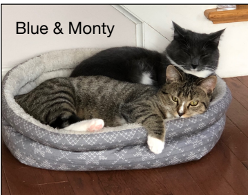
Blue & Monty