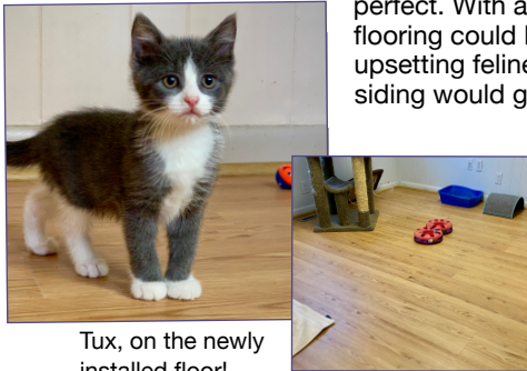
Tux, on the newly installed floor!

During the time of the shut-down, an anonymous donor came forward, generously offering to donate funds for capital improvements. The timing was perfect. With an empty shelter, new flooring could be installed without upsetting feline residents. And new siding would give the building a much-needed facelift. The donor was eager to support not only the shelter but also the local economy during the weeks when so many jobs were lost.