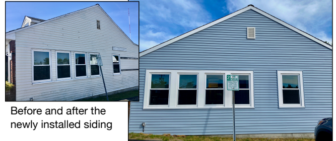
Before and after the newly installed siding

HSAR is now open again, though with some changes to keep volunteers and visitors safe. Adoption hours will be by appointment only, and visitors will be required to wear masks and practice social distancing. To make an appointment, call Judy at 781-534-4902.