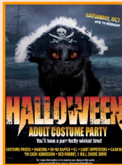
Poster by: Mazcreative.com