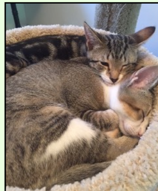
Bruiser and Bucky

A wonderful family in Hingham adopted Bruiser and his brother. His new family brought him to his eye appointments and took amazing care of him until he was old enough for surgery. When he came home from his operation, his new adoptive mom gave him his medicine and his brother Bucky provided the