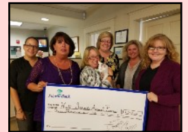
The staff of Pilgrim Bank in Cohasset donated $1,000